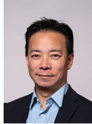
The Rt. Hon. Justin P. J. Trudeau, P.C., M.P. Prime Minister of Canada